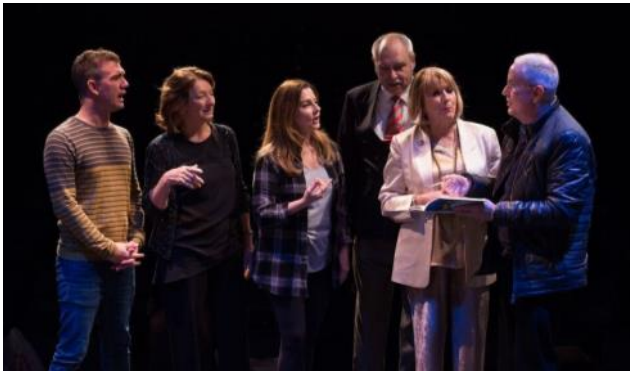
Other Desert Cities cast in rehearsal