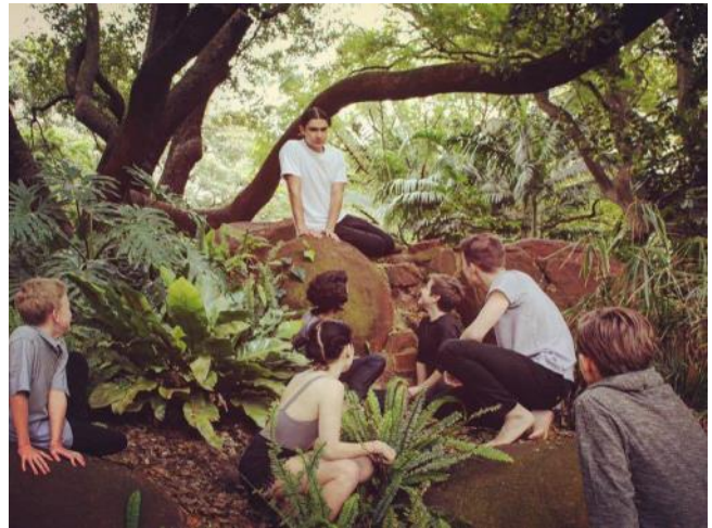
Seeonee Wolf Pack, presided over by Akela, the Lone Wolf.

“For the strength of the Pack is the Wolf, and the strength of the Wolf is the Pack.”