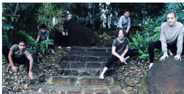
Monkeys in the Cold Lairs