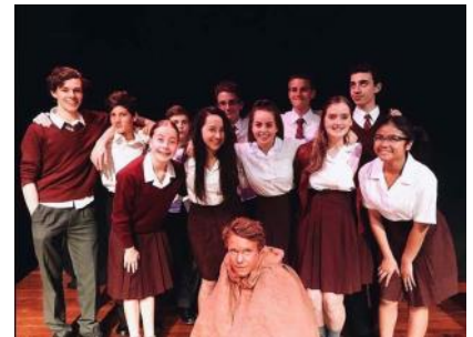
The cast of Early Man

Youthfest: http://www.ita.org.au/2016/09/youthfest-2016-results/