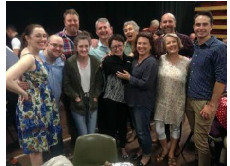
Members of the cast of 2015 production A Man of No Importance reunite

All sponsors and donors are listed below. We thank them for their generosity and trust you will consider supporting the local small businesses.