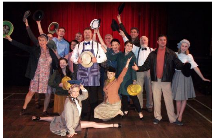
The cast of A Man of No Importance