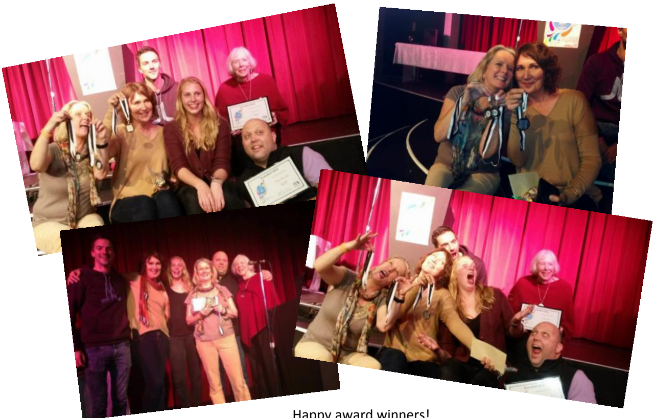
Happy award winners!