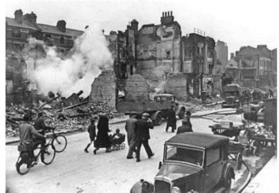
London street shows damage typical of that endured during World War II